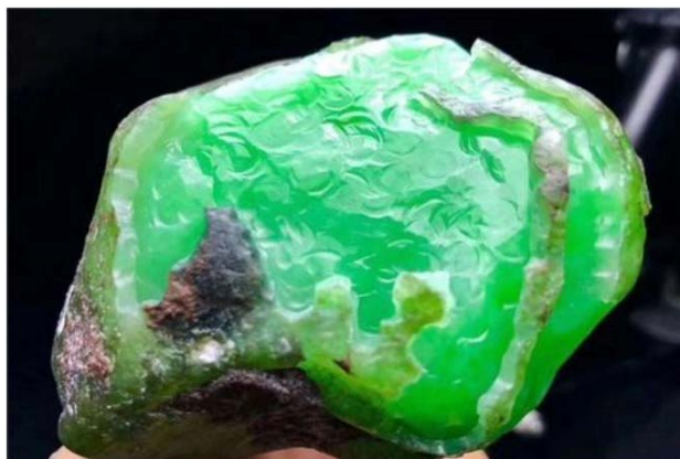
Figure 1 Jadeite ore

In a broad sense, "jadeite" has no strict petrological definition. Any rock with jadeite characteristics can be jadeite. The general characteristics of jadeite are: fine texture, specific mechanical strength and processability. It has good color and light effect after grinding. Jade has different types, they have special jadeite characteristics. Jed's quality of the same type is very different, just like the Jed interface of the same size, which can reach tens of thousands of people from the original to the original. In order to identify the types of jadeite, people use different glue to sell jadeite economically. Jadeite is the surface characteristics of some physical properties of rock, which depends on the characteristics of rock structure and mineral composition[8]. However, how to combine the two organically and find out the best points of Jed is an important research topic in the future. In order to explain the structure, mineral composition and properties of jadeite, one or two examples are given.